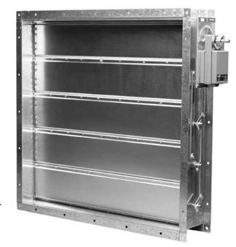
Damper for air intake with heat insulating blades.