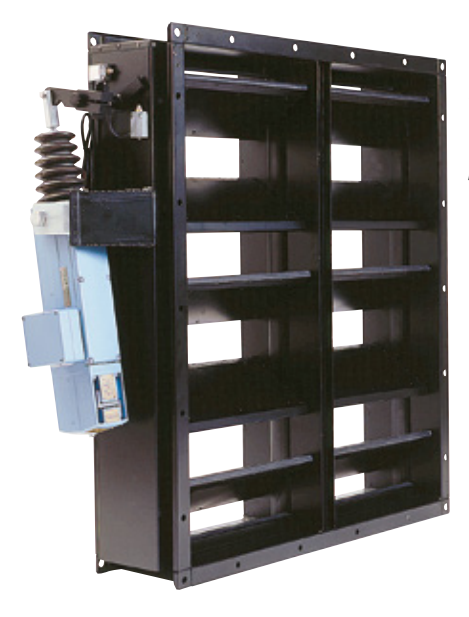
High pressure damper, manufactured to withstand pressure over 10.000 Pa.